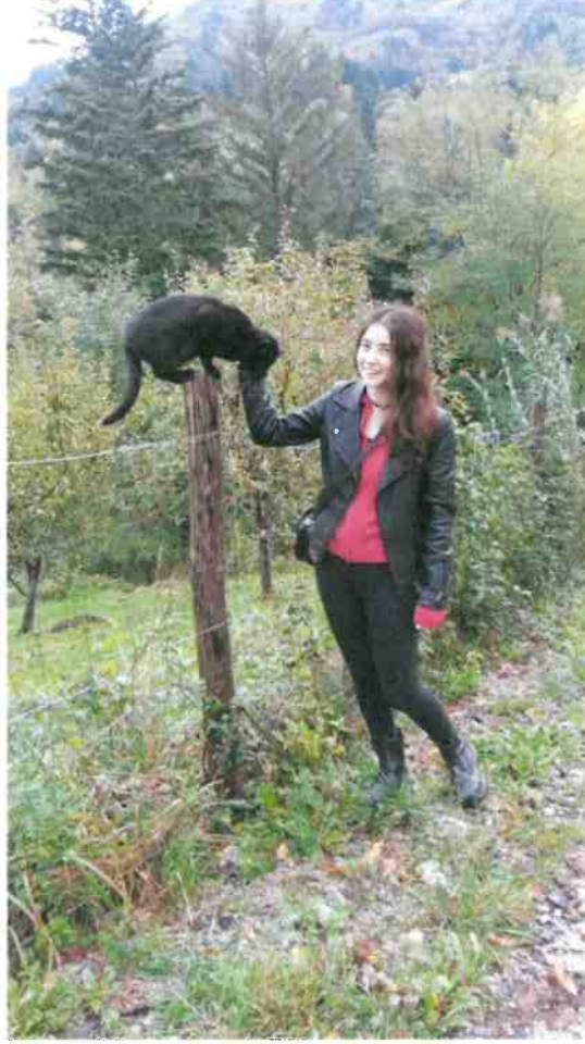
Caring with cat