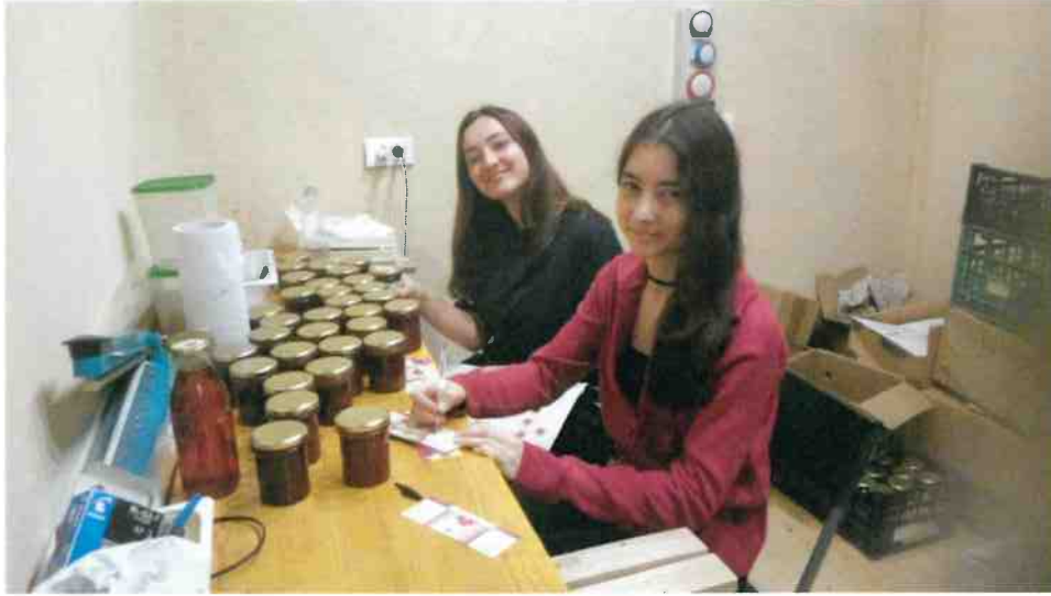
Working in the store