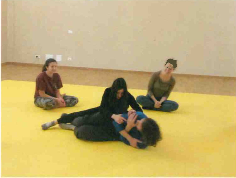
Play and Fight group activity