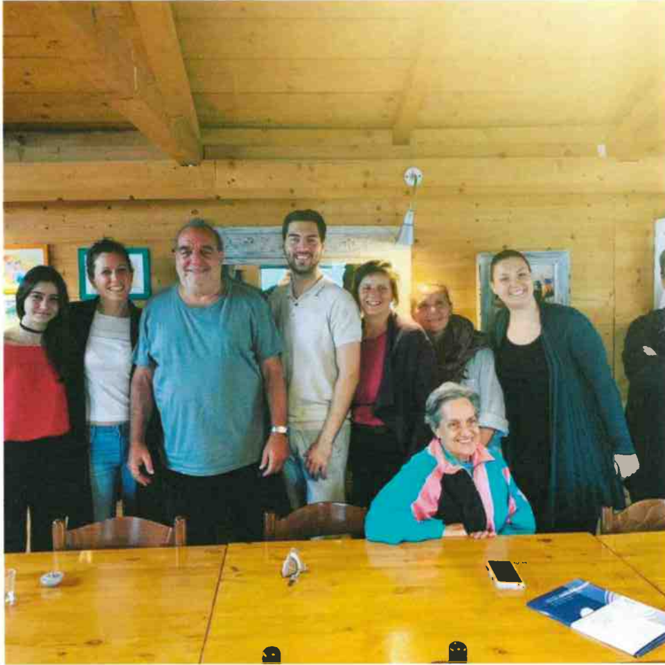
Dealing with association