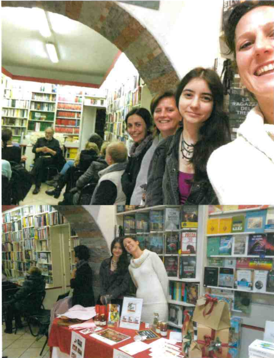
Participating a book presentation and Centroanidra's products