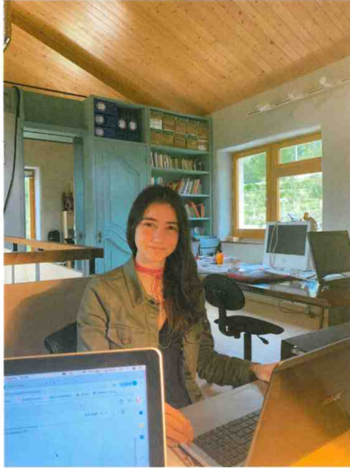
Working at the office