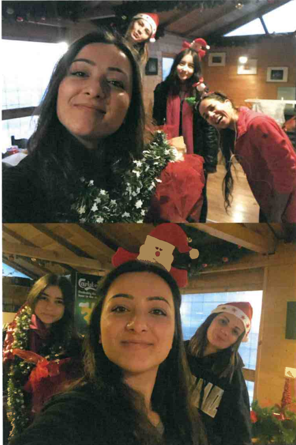
Preparing christmas decorations