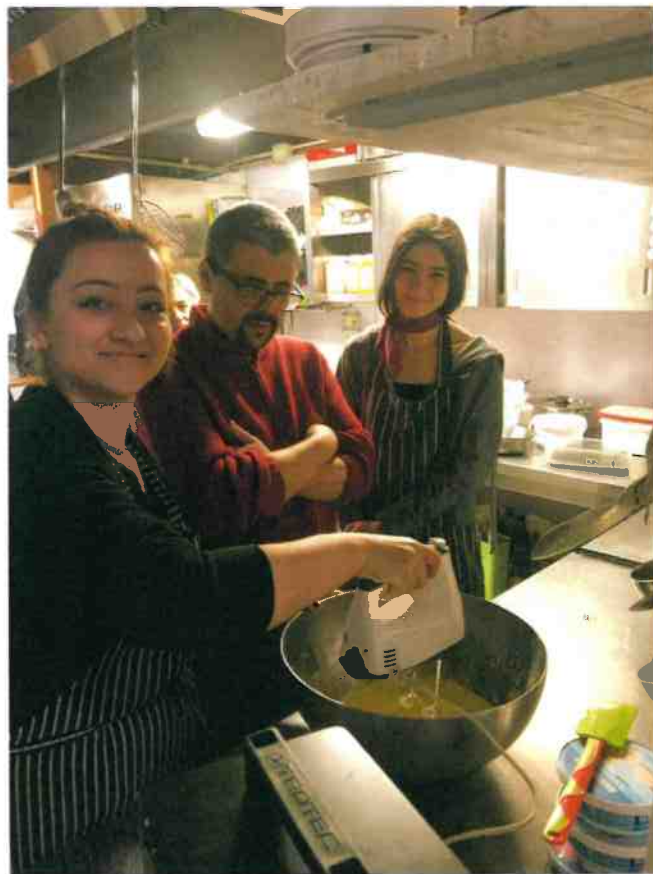
Learning how to make Tiramisu