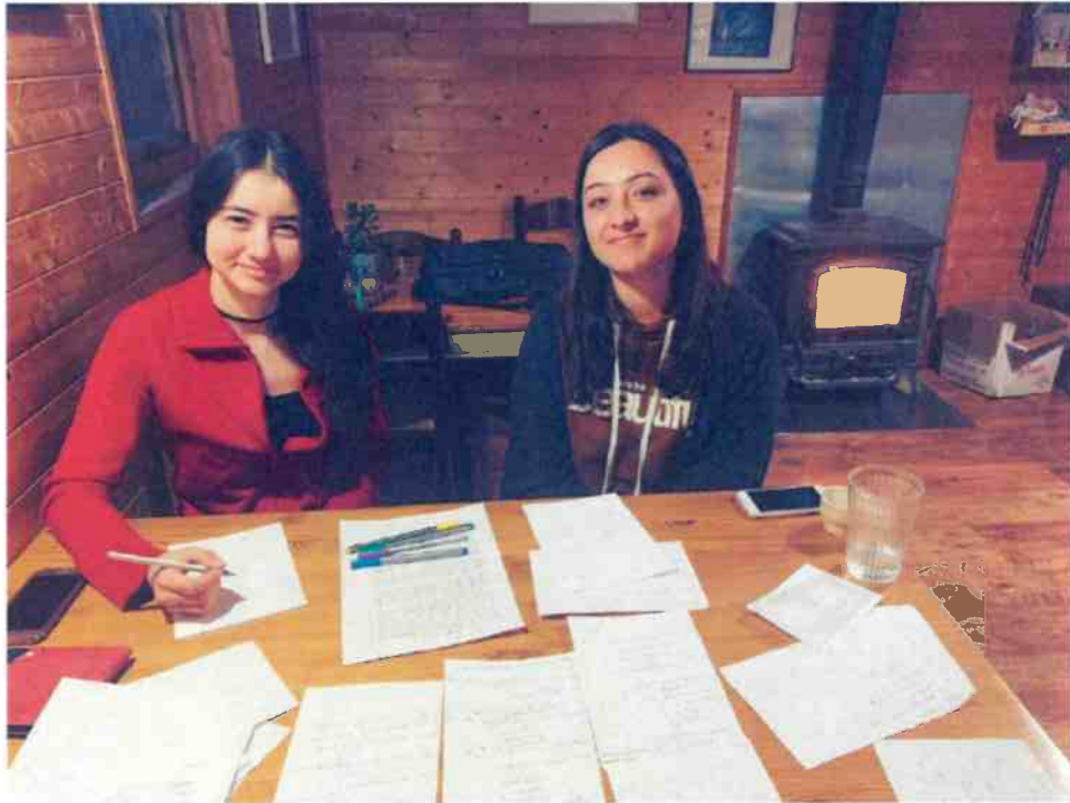
Grammatical Analysis on Italian