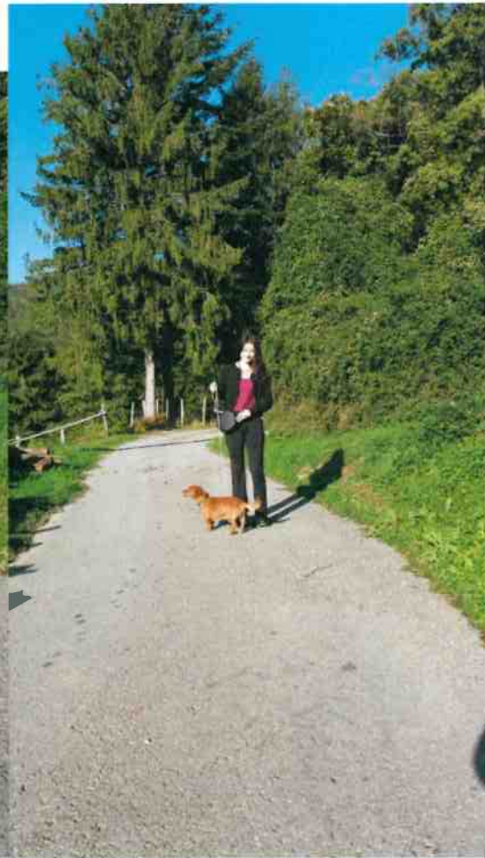
Walking With Zen