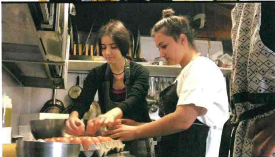
Learning and cooking Italian foods